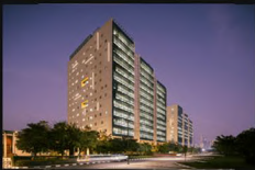
TATA INTELLION EDGE