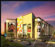
MALL OF INDIA NOIDA